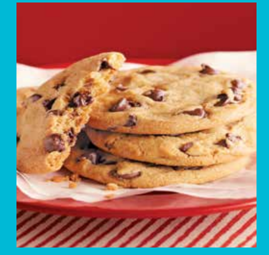
Chocolate Chip Semi-sweet chocolate chip folded into rich, buttery cookie dough create the ultimate chocolate chip cookie experience. #AA