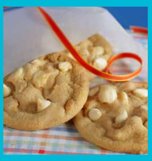
White Chocolate Macadamia Nut Loads of white chocolate chips and generous chunks of macadamia nuts make every bite of this delicious cookie absolutely unforgettable. #CC