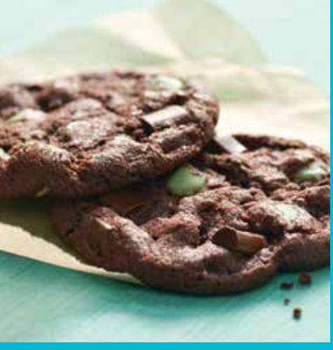
Mint Chocolate Chunk Rich Barry Callebaut® Belgian chocolate chunks and refreshing mint confections folded into chocolate dough celebrates a classically indulgent combination. #KK

Strawberry Shortcake White confectionery chips, sweet dried strawberries and tart dried cranberries combine for such a blast of delectable flavor, you'll savor every bite. #JJ