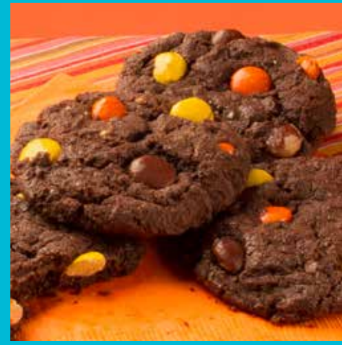
Chocolate Reese's Pieces<sup>®</sup> A chocolate cookie dough base loaded with Reese's Pieces<sup>®</sup> candies for a peanut butter and chocolate delight – everyone's favorite flavor combination! #BB