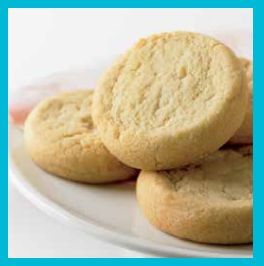
Butter Sugar Smooth creamy butter blended with just the right balance of sugar makes this classic cookie taste just like it was baked from scratch. #EE