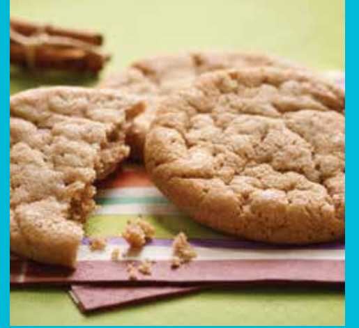
Snickerdoodle Cinnamon and sugar combine in harmonious flavor for a warm, sweet aromatic taste that's even better than you remember. #II

Carnival Colorful semi-sweet confectioncovered chocolate candies make this cookie fun to look at – and even more fun to eat. #HH