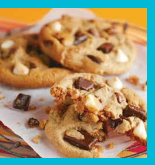
Triple Chocolate Chunk Silky pieces of rich dark chocolate, milk chocolate and white chocolate come together to create a dreamy trifecta of chocolaty decadence. #FF