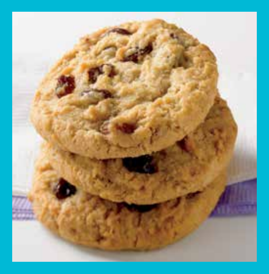
Oatmeal Raisin Rolled oats, plump California raisins and aromatic cinnamon spice combine for a delightful taste that provides the ultimate comfort of home. #DD