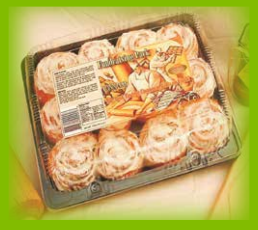
For best flavor, cinnamon rolls should be served warm and can be heated in microwave or conventional oven. Specific heating instructions are included in package.

Each package includes 12 mini-rolls (30 oz.).